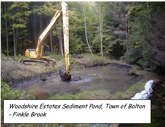
Woodshire Estates Sediment Pond, Town of Bolton - Finkle Brook

When working on the Artist Falls reservoir/sediment pond in the late 1990's, a stream survey showed a smaller upstream pond with an earthen dam on the northernmost tributary to Finkle Brook. This pond is located on private property known as Woodshire Estates, just upstream the outlet's confluence with Finkle Brook (approximately 1/2 mile upstream of Artist Falls). This pond was completely filled in with sediment, and was a prime site to conduct a cleanout effort. The establishment of this basin would help retain sediment from this major arm of Finkle Brook. This project would also reduce the sediment load being delivered to Artist Falls, extending the interval between required cleanouts.