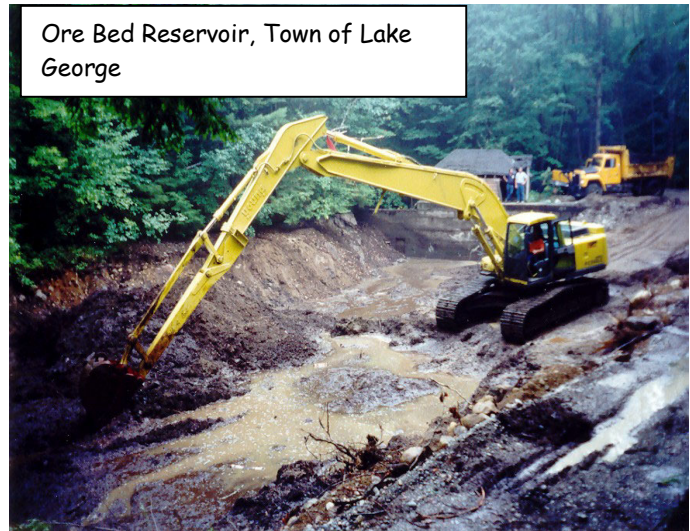
Ore Bed Reservoir, Town of Lake George

The second reservoir cleanout to be conducted through this new initiative was also within the Town of Lake George. Ore Bed Reservoir on West Brook, also a man-made structure with a hybrid concrete and stone/mortar dam, was the site of the second cleanout. Ore Bed is located within the West Brook watershed above the location of the Lake George transfer station, and is owned by the Village of Lake George. Like Hubble Reservoir, Ore Bed was another old water supply for the Village of Lake George, prior to its abandonment when the Village began taking water directly from the Lake. This reservoir was also completely full of sediment and was in need of cleanout during the mid 1990's.