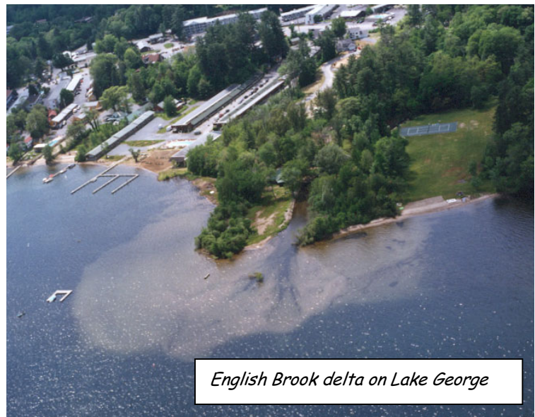
English Brook delta on Lake George