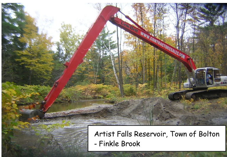
Artist Falls Reservoir, Town of Bolton - Finkle Brook

Finkle Brook is one of the major tributaries to Lake George. Like most of the other major tributaries to the lake, a large delta exists as evidence of a large sedimentation problem associated with Finkle Brook. In continuation of the reservoir/sediment capture concept utilized on West Brook, a project was proposed to address sediment capture on Finkle Brook. Located approximately one-half mile upstream of Lake George on Finkle Brook is the old Sagamore Resort water supply reservoir. This reservoir was created in the early 1900's to provide water to the Sagamore and its associated properties.