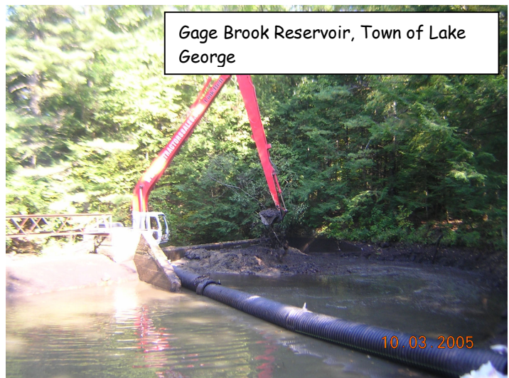
Gage Brook Reservoir, Town of Lake George

This reservoir is located on West Brook at the confluence of West Brook and a much smaller brook known as Gage Brook. It is located approximately three quarters of a mile downstream of Ore Bed Reservoir, on the same stream. Even with this large reservoir upstream,