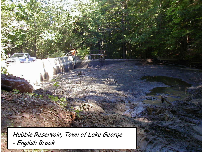
Hubble Reservoir, Town of Lake George - English Brook

Sediment had accumulated in this reservoir since its last maintenance cleanout in the 1960's or 70's, and was completely full to capacity (approximately 1,000 cubic yards). As such, there was no slowing of the stream, and no in-stream sediment was being captured.