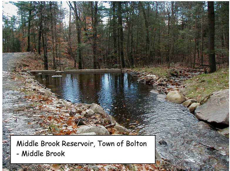
Middle Brook Reservoir, Town of Bolton - Middle Brook

filled in with sediment, this site became another candidate for cleanout when discovered in 2005 by LGA's retained engineer, Dave Myers, P.E. This reservoir is located on private property approximately 200 feet upstream of the brook's crossing under NYS Route 9N. The site is accessed from a driveway off of Route 9N just north of the stream.