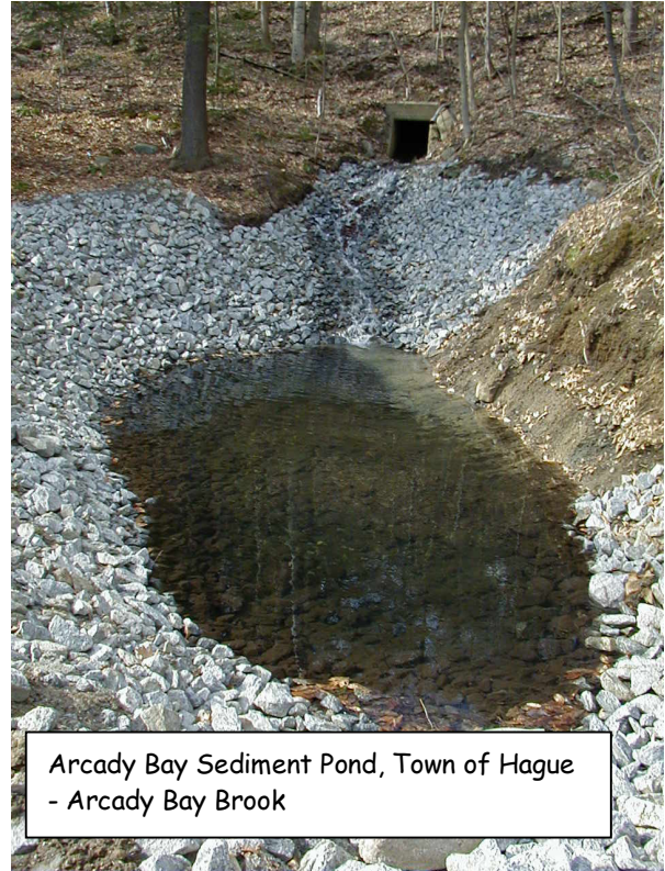
Arcady Bay Sediment Pond, Town of Hague - Arcady Bay Brook

This basin was constructed in two days' time, and now acts to collect sediment from upland sources within the watershed. The relatively steep sidewalls (based upon site conditions) were stabilized with rock and over 400 crownvetch plants planted by SWCD staff. The capacity of the basin is considerably smaller than it could be, as no riser was installed on the outlet pipe to raise the effective water level in the basin. This was a result of concerns of the Arcady Bay Association regarding liability and an open water source. While the actual probability of a liability event appears minimal, it nevertheless was the deciding factor in keeping a lesser volume in the basin.