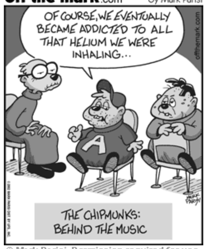
© Mark Parisi, Permission required for use.