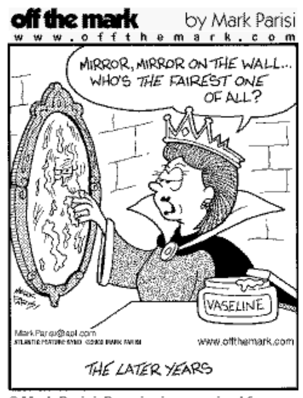
© Mark Parisi, Permission required for use.