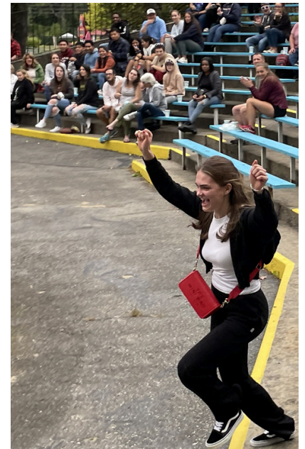
Excited raffle winner heading to the stage

The charity of choice this year was Family Services Association of Glens Falls, receiving $1010 from proceeds from guests, donations, and food sales.