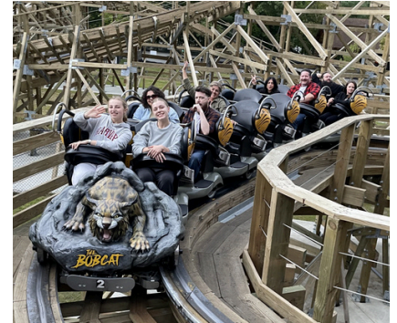
2024 Attendees riding the Bobcat Rollercoaster