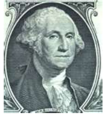
22 nd George Washington – 1 st President (1789-1797)