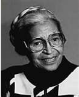
4 th Rosa Parks -- Asserted Civil rights by refusing to give up her bus seat