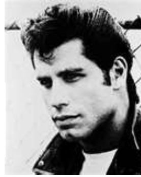
18 th John Travolta – Icon from “Saturday Night Fever” + “Pulp Fiction”