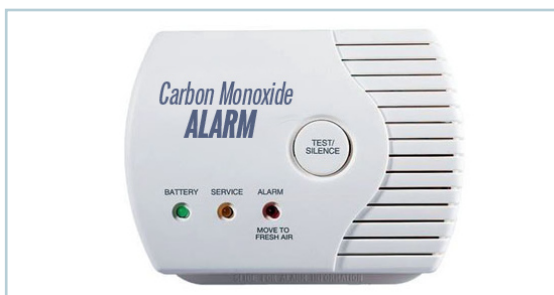
A Common Home CO Detector

Since carbon monoxide is colorless, odorless, and tasteless, the best way to alert your family is to install a carbon monoxide detector/alarm to warn of the gas's build-up.