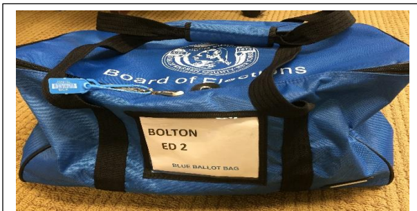
Blue Ballot Bag