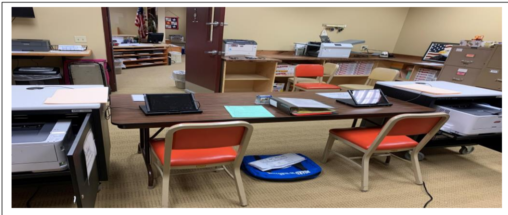
Example of an Inspector Table set-up back