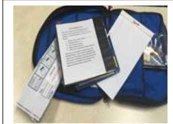
Blue Inspector Bag