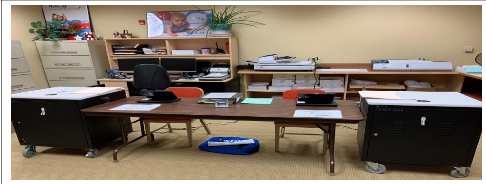
Example of an Inspector Table set-up front