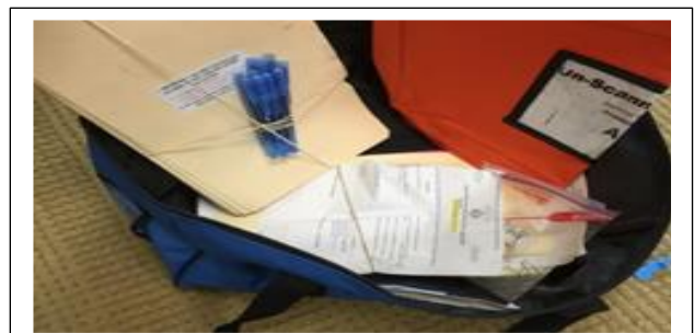
Contents of Blue Ballot Bag