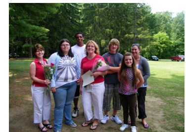
Headstart supervisors and summer employees