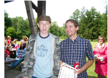
Over 165 employees, worksite supervisors, agency personnel, dignitaries, family and friends attended the ceremony on August 20, 2009.

Following the program youth who participated are asked to complete an anonymous survey about their experience. Here are a few quotes from the responses we received: "It was the perfect 1 st job." "It helped me figure out my likes and dislikes." "Got me situated with working in a job environment." "I know now that I can ask questions without feeling stupid." "It has prepared me better for different jobs in life. I have more skills." "Now I feel I can go out and get a job."