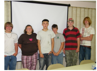
Cornell Crew following Power Point presentations

Six youth worked with staff from Cornell Cooperative Extension in Warrensburg. They assisted with program preparation and development, pre-trip planning and equipment checks, and fair set up and clean up. All the youth completed their employment experience with many new marketable skills and leadership abilities. They learned the basics of Power Point and did public Power Point presentations at the end of the program.