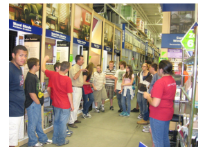
BOCES crew exploring careers at Lowe's in Queensbury